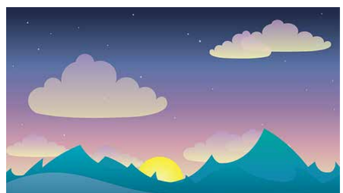
We commit ourselves to seeking God who beckons to us from a future abundant in grace -- LCWR Call 2015-22