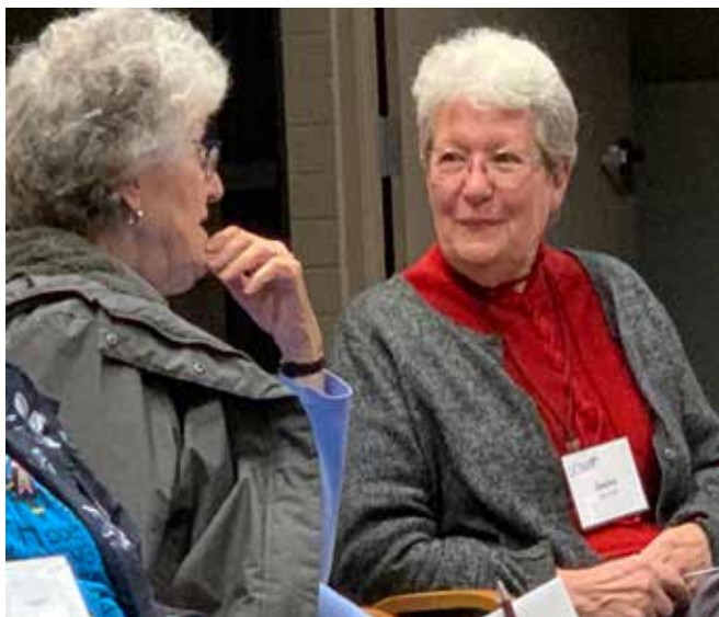
This new effort will explore collaborative and creative ways to meet the shifts unfolding in religious life

The conference thanks all the leadership teams who completed and returned the form sent in November requesting information. The response has been remarkable with a very high measure of interest and participation. Any congregation that did not return the form (asking for data on each institute) is asked to do so as soon as possible so that the national profile that LCWR generates is as accurate and complete