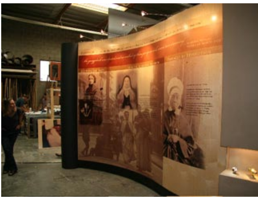
Seruto & Co., the firm designing "Women & Spirit: Catholic Sisters in America," displays one of the nine-foot tall panels that will make up the LCWR history exhibit.

The exposition will open on May 15, 2009 at the Cincinnati Museum Center. Announcements of other venues will follow.