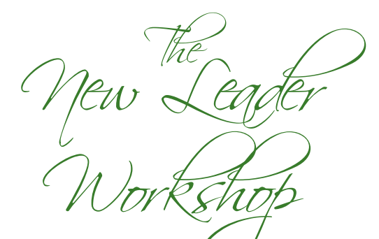
Presented by the Leadership Conference of Women Religious

March 15-18, 2012 University of St. Mary of the Lake, Mundelein, Illinois