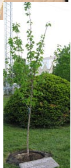
The maple tree planted by CRC in Quebec