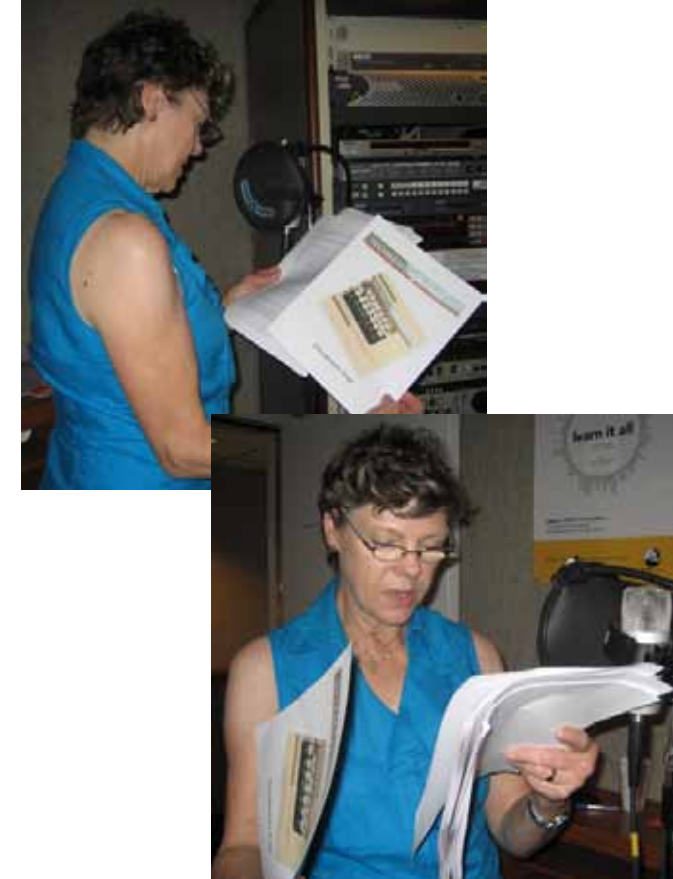
Cokie Roberts narrates the Women & Spirit documentary at the ABC studios in Washington, DC

LCWR members are asked to promote the DVD within their own institutes, as well as to churches, schools, bishops, vocation offices, women's groups, libraries, and other groups or locations. All proceeds from the sale of the DVD will help support the mission of LCWR.