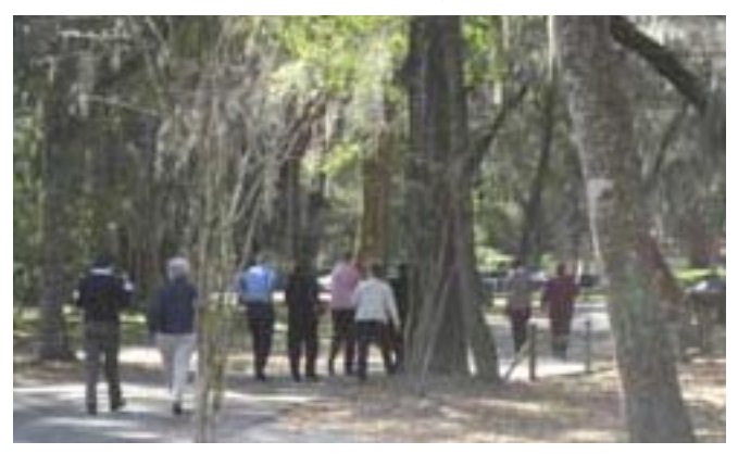
The national board meetings took place in Jacksonville, Florida