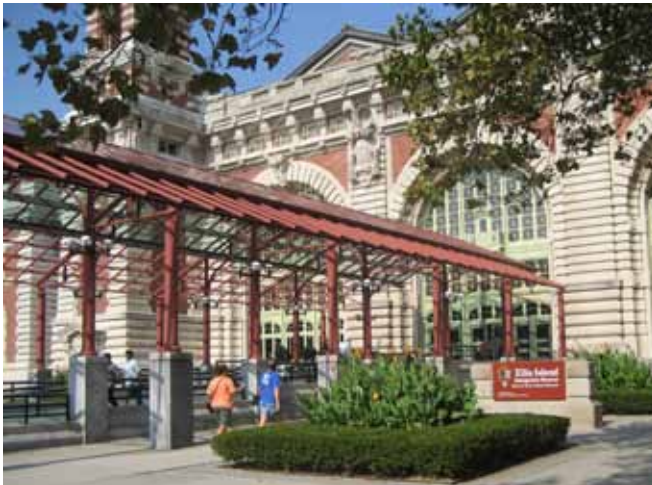
Entrance to the Ellis Island Immigration Museum