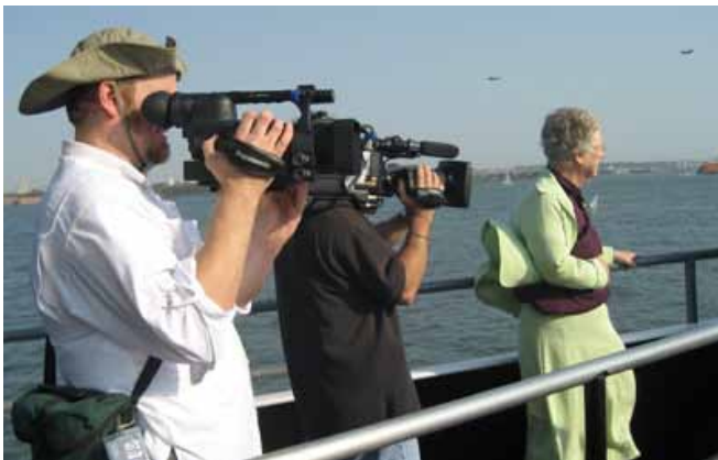
The crew working on the Women & Spirit documentary filmed the ferry ride and opening ceremonies on September 22