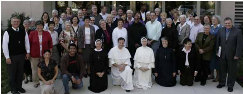
Participants in the NRVC vocation symposium held in Chicago