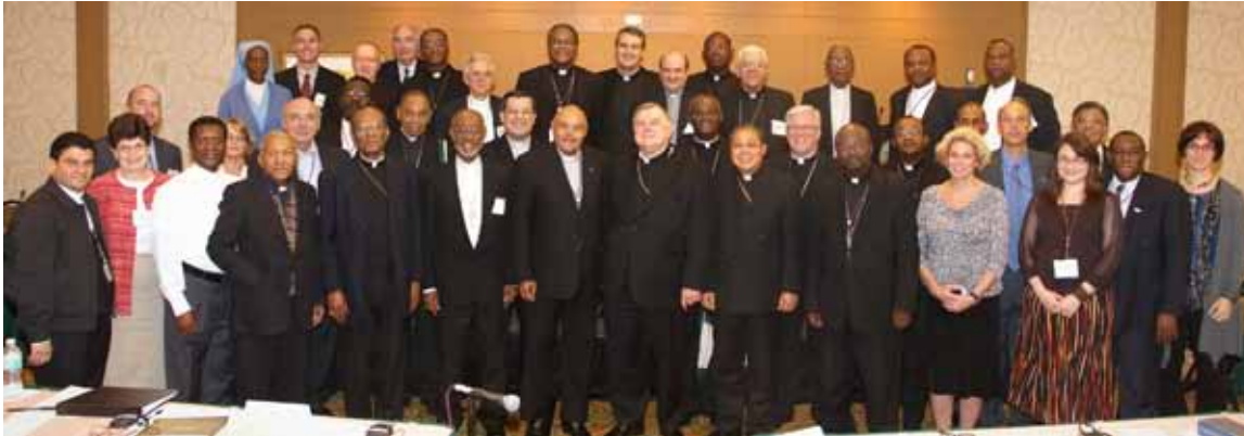
Participants in the meeting on Haiti held in Miami