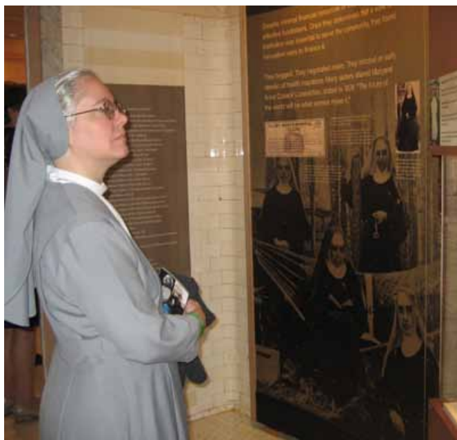
Many women religious from the area have been visiting the exhibit