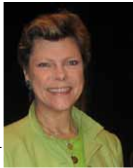
Cokie Roberts at the 2009 LCWR assembly

Cokie Roberts, National Public Radio senior news analyst and ABC News political commentator, will donate her services as the narrator of the Women & Spirit documentary being produced by LCWR.