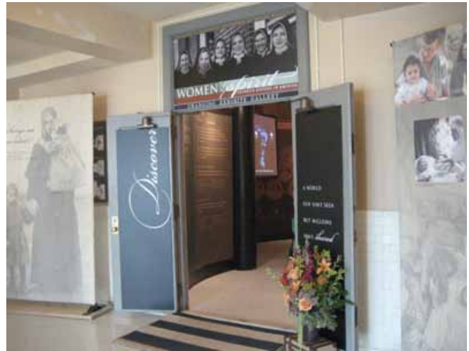
Entrance to the Women & Spirit exhibit