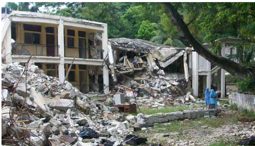
in May of the remains of the seminary in Port-au-Prince that was destroyed during the January 12 earthquake.