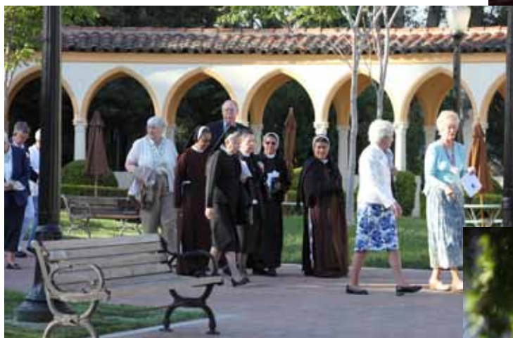
Guests at the opening walk from the college chapel to the banquet and program hosted by Mount St. Mary's College