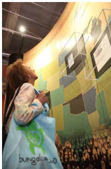
Visitors tour the exhibit at Mount St. Mary's José Drudis-Biada Art Gallery