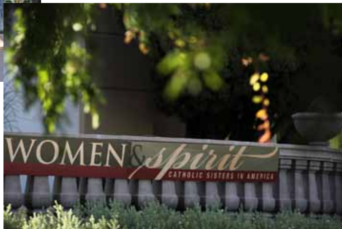
A Women & Spirit banner hangs outside the college chapel