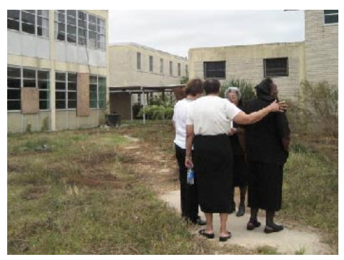
Touring the grounds of the school of the Sisters of the Holy Family of New Orleans