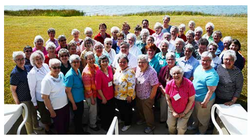
Imagining Justice drew 50 people to Bethany Center in Florida

"Progress on Climate Change—Finally" can be downloaded at lcwr.org/sites/default/files/publications/files/rta3-16.pdf