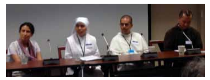
Panel of newer women and men religious from diverse cultures at the NRVC symposium.

The symposium also included input from newer religious from cultures outside of the United States on their personal experiences of formation and integration. Symposium participants also shared their own best practices, as well as insights into the challenges of intercultural religious life, particularly the challenges noted in the study of some unwillingness to change to accommodate other cultures on the part of professed members of the congregation and the aging of US religious congregations.