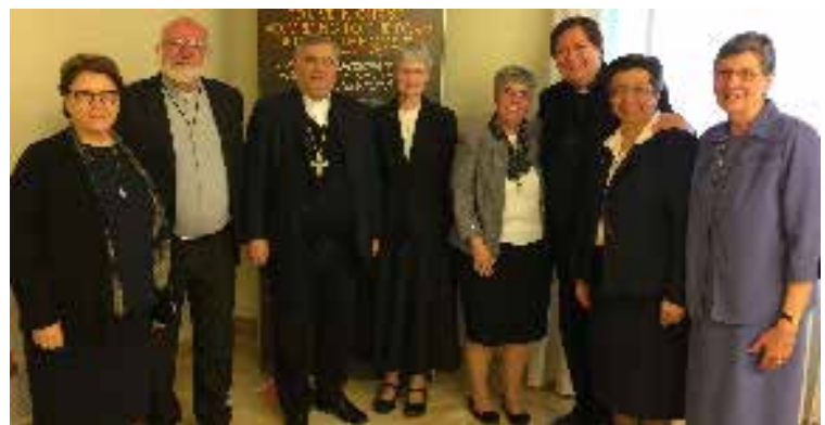
▲ Congregation for Institutes of Consecrated Life and Societies of Apostolic Life