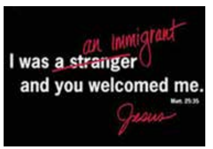
Graphic by Catholic Sisters of the Upper Mississippi Valley