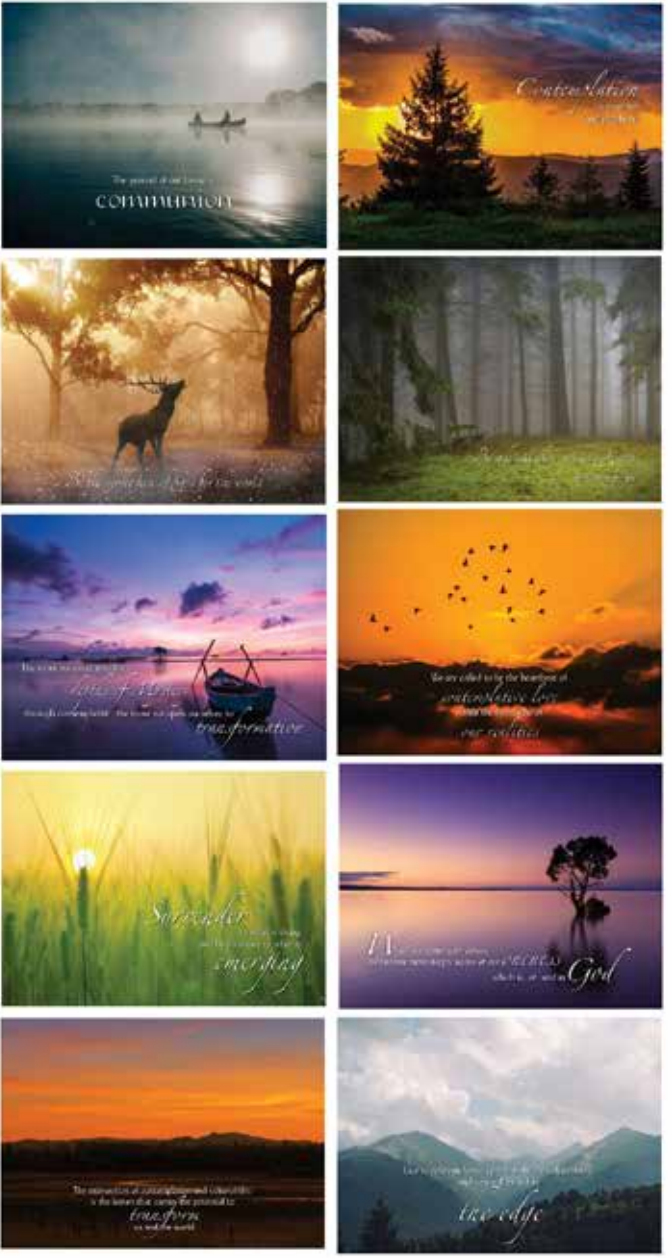
LCWR Contemplative Greeting Cards