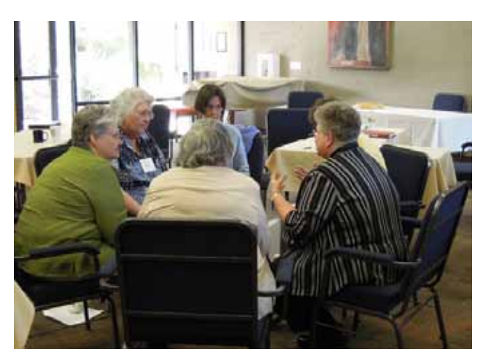
LCWR board engages in the "Behold, I am Doing Something New Contemplative Process"

In concluding the meeting, the board and staff engaged the LCWR "Behold, I am Doing Something New Contemplative Process" to corporately reflect on the meeting proceedings in light of what they may be calling women religious to in the future. Noting the great willingness of women religious to engage a future that is very much emerging, the final statement of the group from this process is: "Trusting in God, there is an emerging, collective readiness for ..."