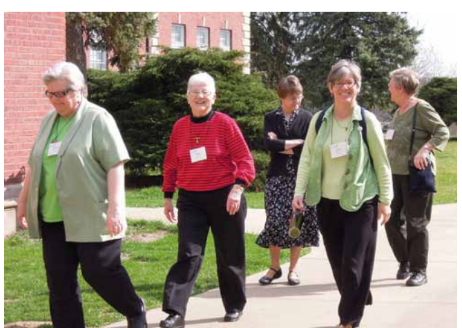
Participants enjoy the campus at the University of St. Mary of the Lake